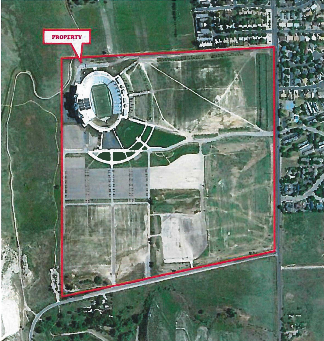
CSU – Annexation of Hughes Stadium Property, Fort Collins, CO